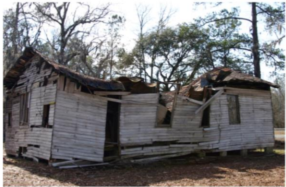
View: Right rear, after damage from storm in 2007