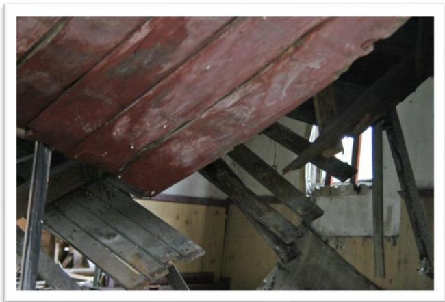
Inside main structure, after collapse 2008