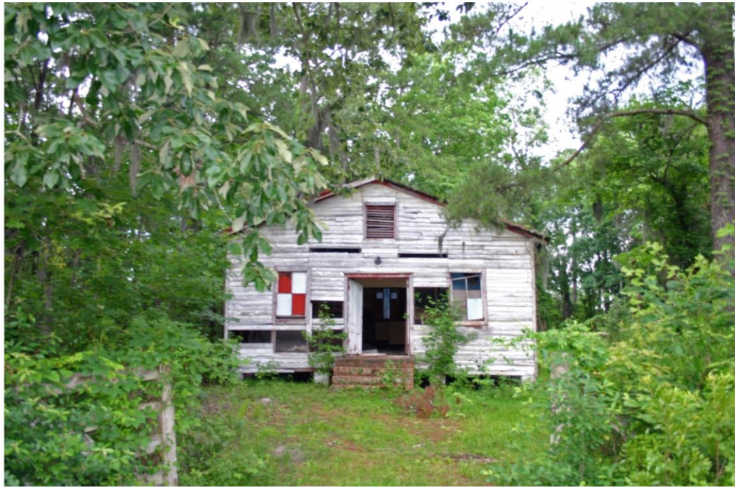
Houston before collapse, 2006