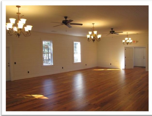
View: Inside Main Structure February 2012