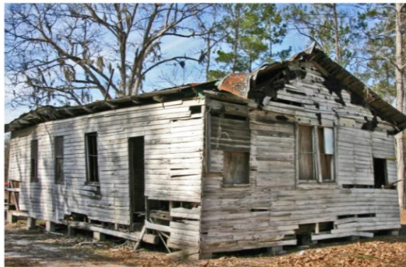
View: Left rear, after damage from storm in 2007