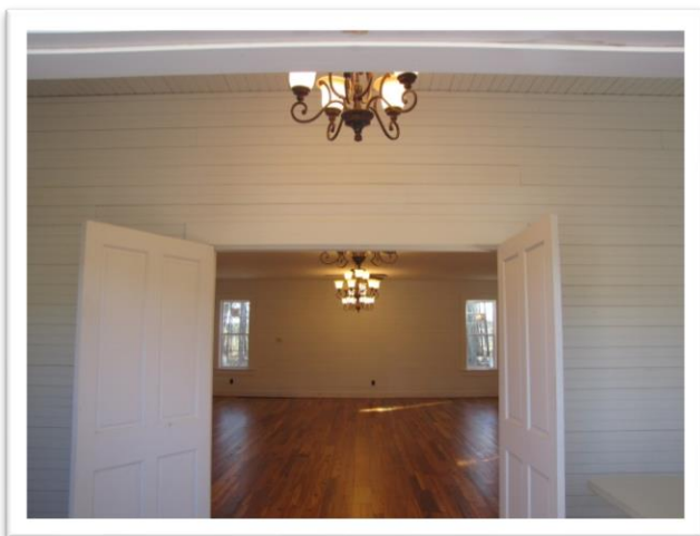
View: Inside entryway