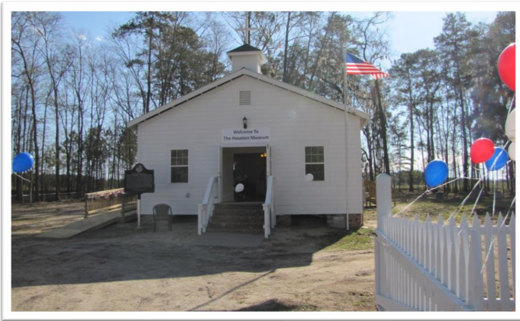
Houston Open House February 25 th , 2012 • View: Front gate entryway