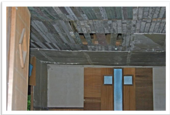
Ceiling view before collapse 2006