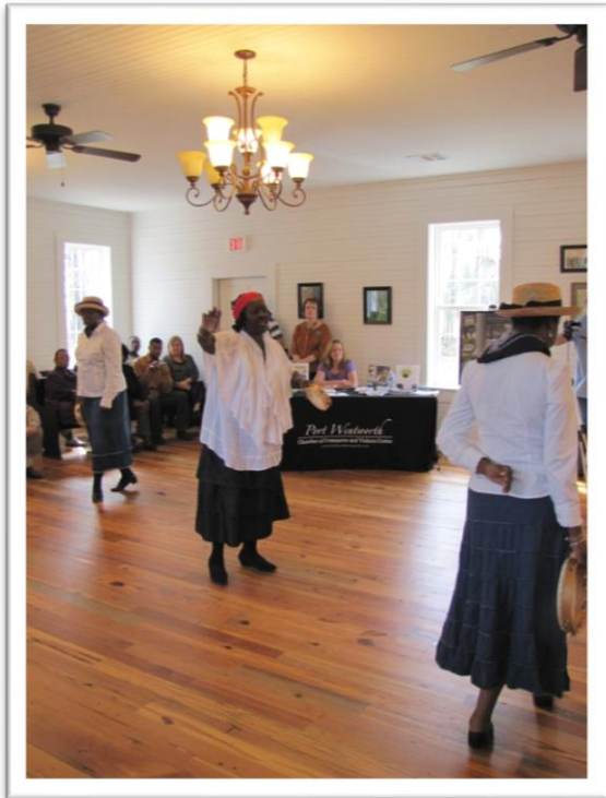
Houston Museum Open House – February 25 th , 2012