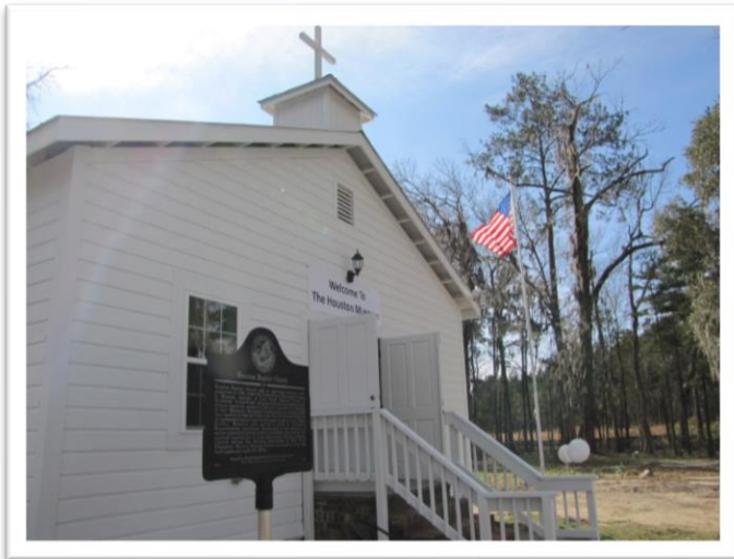
View: Front left